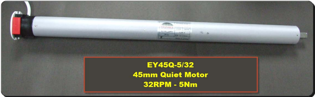
EY45Q-5/32 45mm Quiet Motor 32RPM - 5Nm